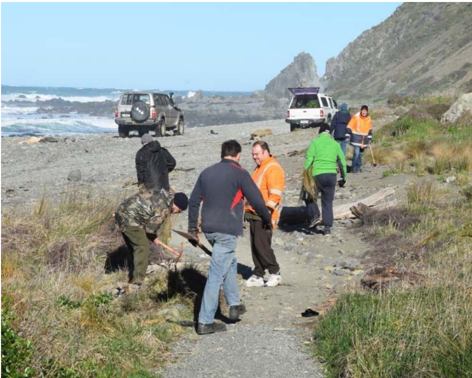
CCVC Planting 3 August 2019

CCVC also regularly assist Wellington City Council with plantings around the South Coast adding some 400 odd trees and shrubs in the ground recently as part of their revegetation project.