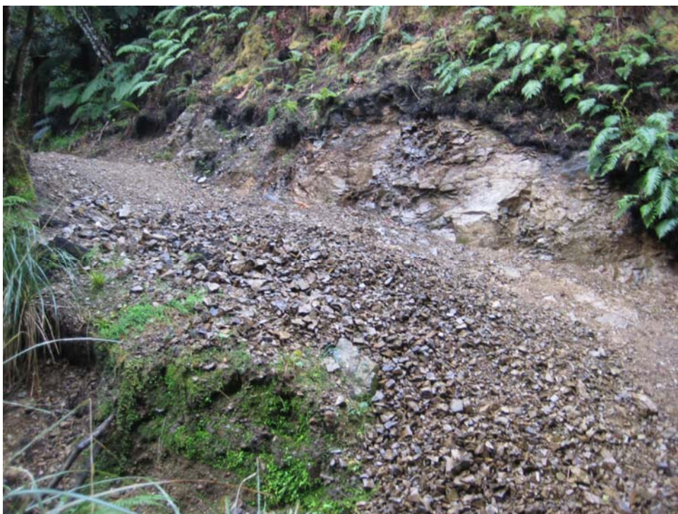
The Rock Garden

Working bees are planned at the bottom of the Rock Garden to reopen it to 4WD traffic. Although reopened a few years ago with GW funding a round of explosives, it has since seen slippage block the road again. This time work will be mostly manual with some hand-held machinery.