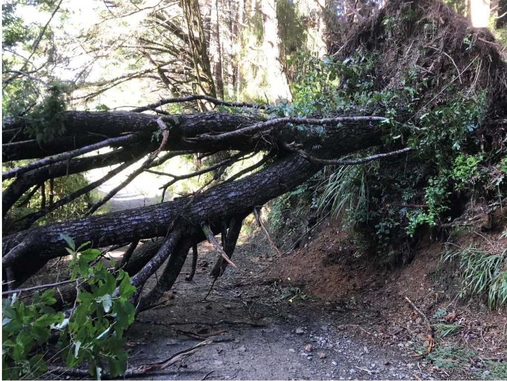
A tree blocking the very bottom of Hydro Road

Other works have taken place to improve the dam supplying the water to the Orange Hut and its sink and toilet.