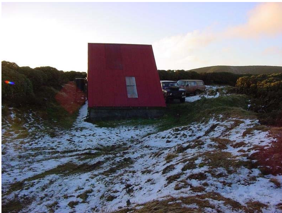
A-Frame Hut Under Discussion

A small group met with DOC in Palmerston North recently to discuss options for Takapari Road and the A-Frame Hut.