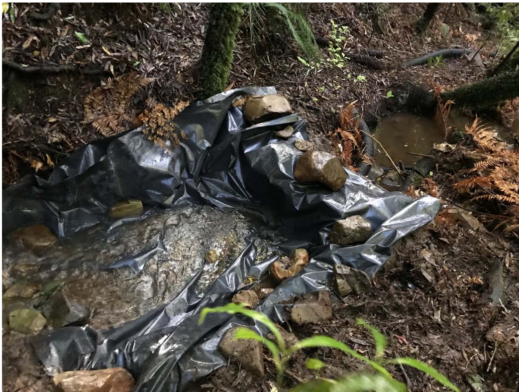
A waterproof membrane to the dam

Other works have taken place to improve the dam supplying the water to the Orange Hut and its sink and toilet.