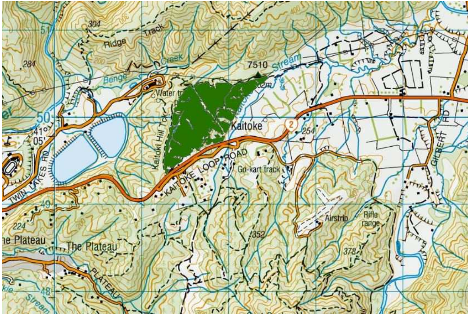
Te Marua Block.