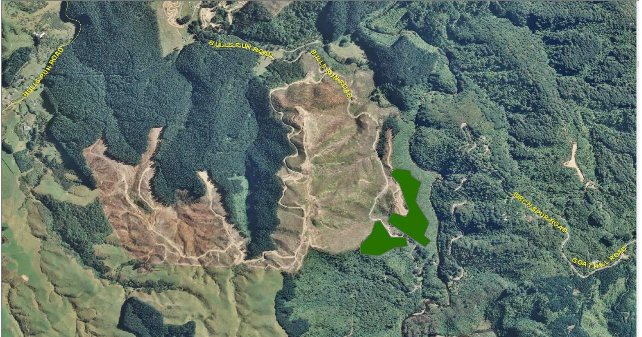
Puketiro Forest, 11km Rallywoods Road