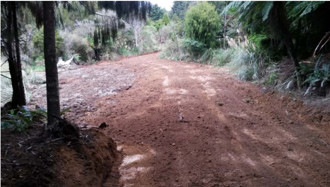
Remember those impassable Bogs?

Nonetheless, please exercise restraint when passing over the Eastern End until it has a chance to heal completely